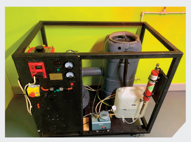
Prototype testing rig

Rates of energy required for hydrogen production from the prototype are comparable to some current large scale commercial production. Scale up from prototype to commercial scale can make this process more efficient.